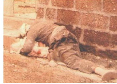
Halabja - March 16, 1988