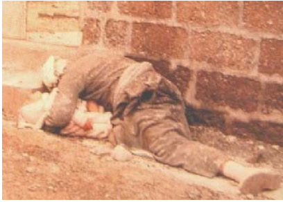
Halabja - March 16, 1988