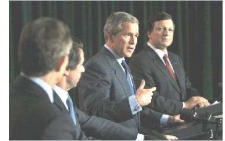
Azores - March 16, 2003

Public and secret documents tell the inside story of how the U.S. government lied about poison gas casualties in the Kurdish town of Halabja during the Iran-Iraq war to justify the U.S. invasion of Iraq. They also reveal the real motivations for war.