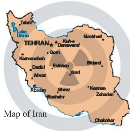
Map of Iran