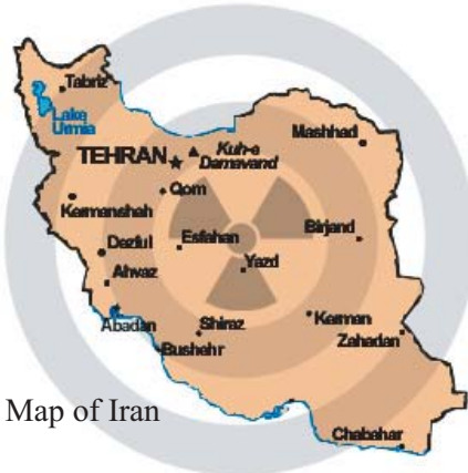
Map of Iran